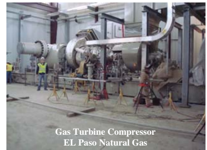
Gas Turbine Compressor EL Paso Natural Gas

Other applications include crane rails with next generation high load gantry cranes, wind turbine bases with substantial uplift forces and rotating equipment with ever tighter alignment tolerances.