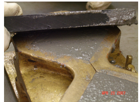
D.5. Screed off excess grout.