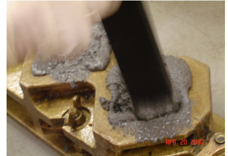
D.3. Fill molds with second layer of epoxy grout, then consolidate to remove entrapped air.