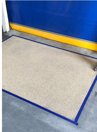
Broadcast calcined Bauxite applied over epoxy coating and RSR Easy Mix™ resulting in an R14 non-slip surface.