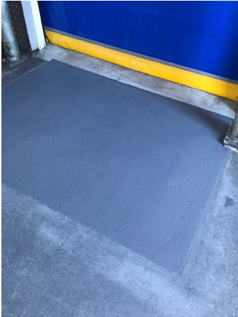
RSR Easy Mix™ prior to epoxy coating.