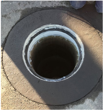
Five Star® Highway Patch placed to reinstate the substrate around the manhole.