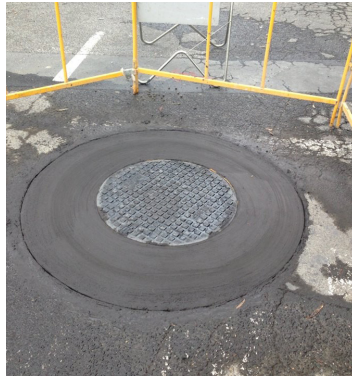
Completed manhole with Five Star® Highway Patch.