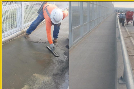
Structural Concrete® ES Repairs to a port of entry bridge sidewalk in Mexico