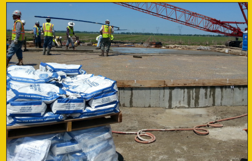
Structural Concrete® ES Overlay Raising a tank foundation to the proper height