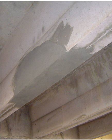
Structural Concrete® V/O Parking Structure Repair

Proven dependable in field installations, the high-performance characteristics of Five Star Structural Concrete® products provide you with easy install of permanent concrete repair solutions with rapid strength gains. Don't settle for a temporary patch with low performance. Rely on Five Star Structural Concrete® products to repair concrete correctly the first time .