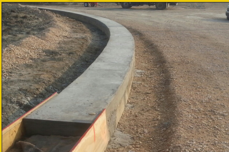
Structural Concrete® ES Tank ring repair in Texas