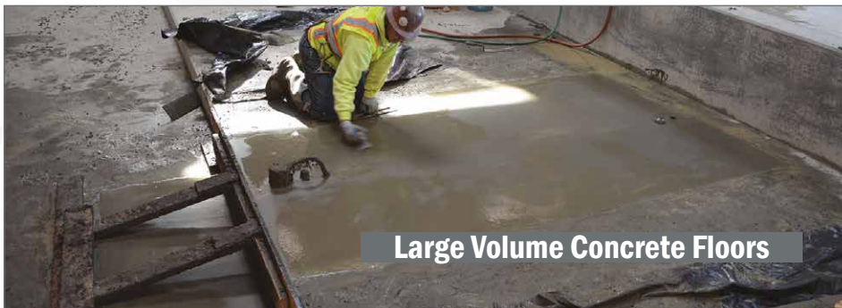
Large Volume Concrete Floors