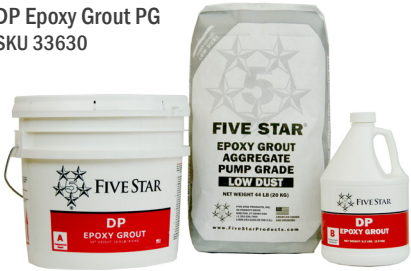
DP Epoxy Grout PG SKU 33630

ALSO AVAILABLE IN A SMALLER UNIT SIZE SKU 33175