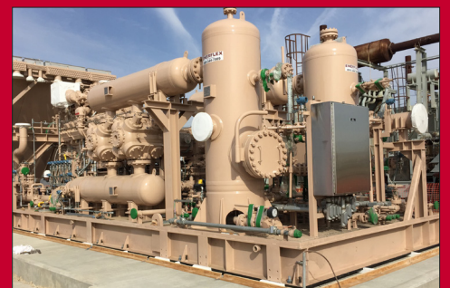
DP Epoxy Grout PG – Compressor Station Grouting