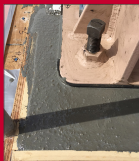
Pouring the DP Epoxy Grout PG