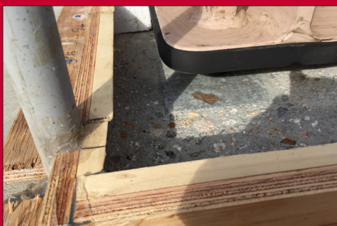
Setting up the forms